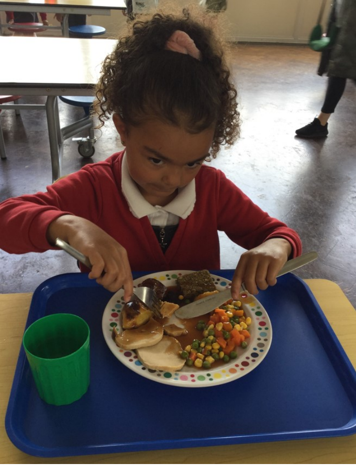
We all eat lunch together and you will have your own seat in our dining hall.