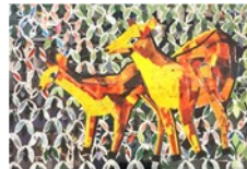
'Two Antelopes' – Rosemary Karuga (1999)

In DT, we will building on our knowledge of materials and the design process to design and build simple shelters.